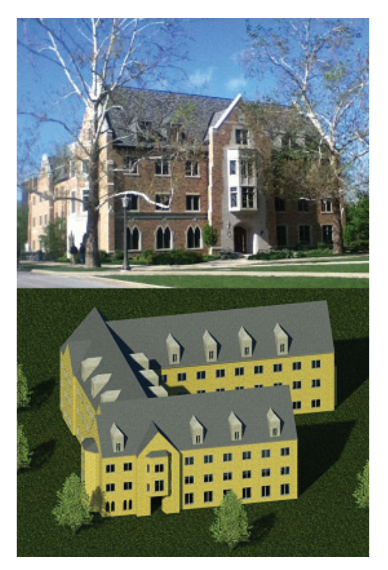
Figure 1a. (image at top) Geddes Hall, completed July 2009; Figure 1b. (image above) Revit<sup>™</sup> model of Alternative Design on the same site.

The primary wall assembly<sup>6</sup> for the structure as-built, or the Subject Case (Figure 1a), is a standard brick-CMU cavity wall wrapping a structural steel superstructure, with a total material embodied energy of approximately 7,093.14 MBtu<sup>7</sup>. When compared to an alternative wall assembly of load-bearing, triple-wythe brick<sup>8</sup>, the total mate-